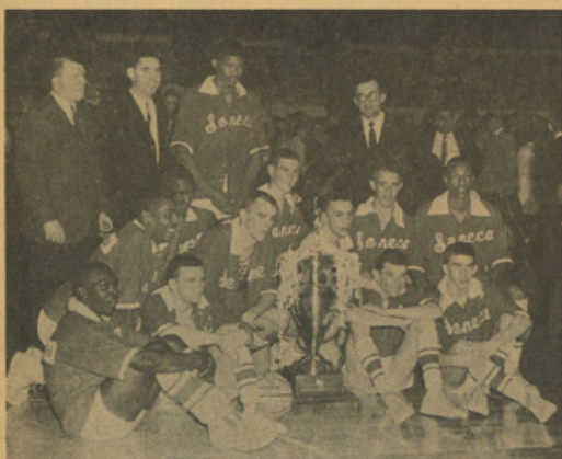
Seneca Redskins sit around the coveted championship award after capturing the state tournament. The trophy will stand at Seneca on a lighted rotating table.