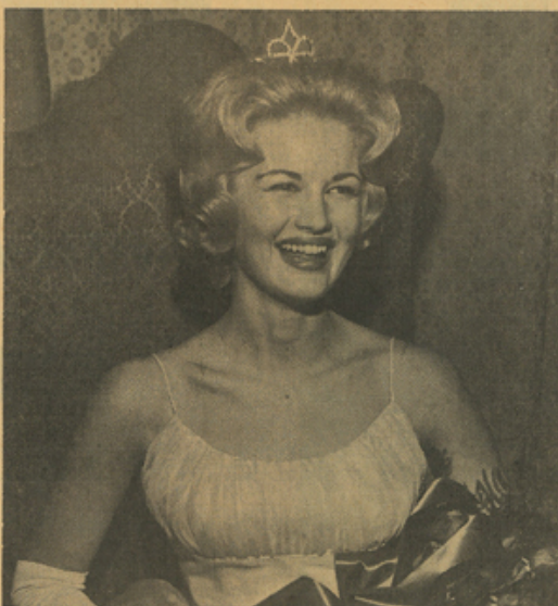
1963 Junior Miss Diane Sawyer.

The entire team is to be congratulated for its state tourney victory. Seneca also finished with a 31-1 won-loss record—the best in the state. Dunbar must be considered the favorite for next year's tourney as they started four juniors and a sophomore. They did not make it this year though, and will have to sit back and wait as Seneca enjoys its finest hour.