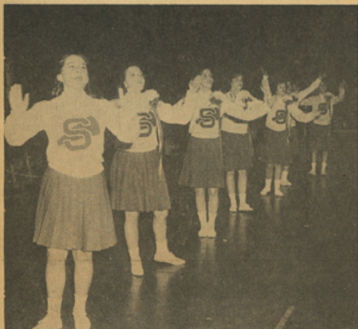
BEFORE THE RAINS CAME — Exhorting the crowd to an all-out effort to match the team's, the Seneca yell corps lead the cheers to victory. Then the tears flowed and continued as the girls received an honorable mention from the Kentucky Pep Association.