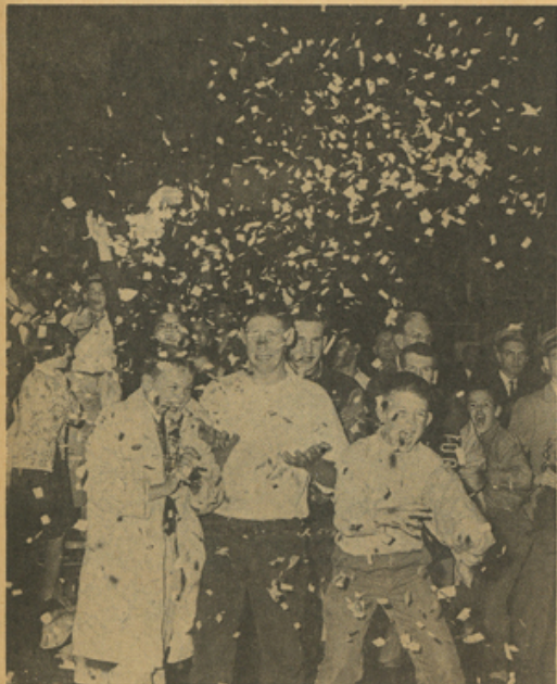
Seneca fans went wild—first quarter, second quarter, third quarter, but when it was over—OH BOY! There was no room in Freedom Hall; confetti; "Drains of Seneca Forever", and exhausted shouts of "We Won" filled the air.